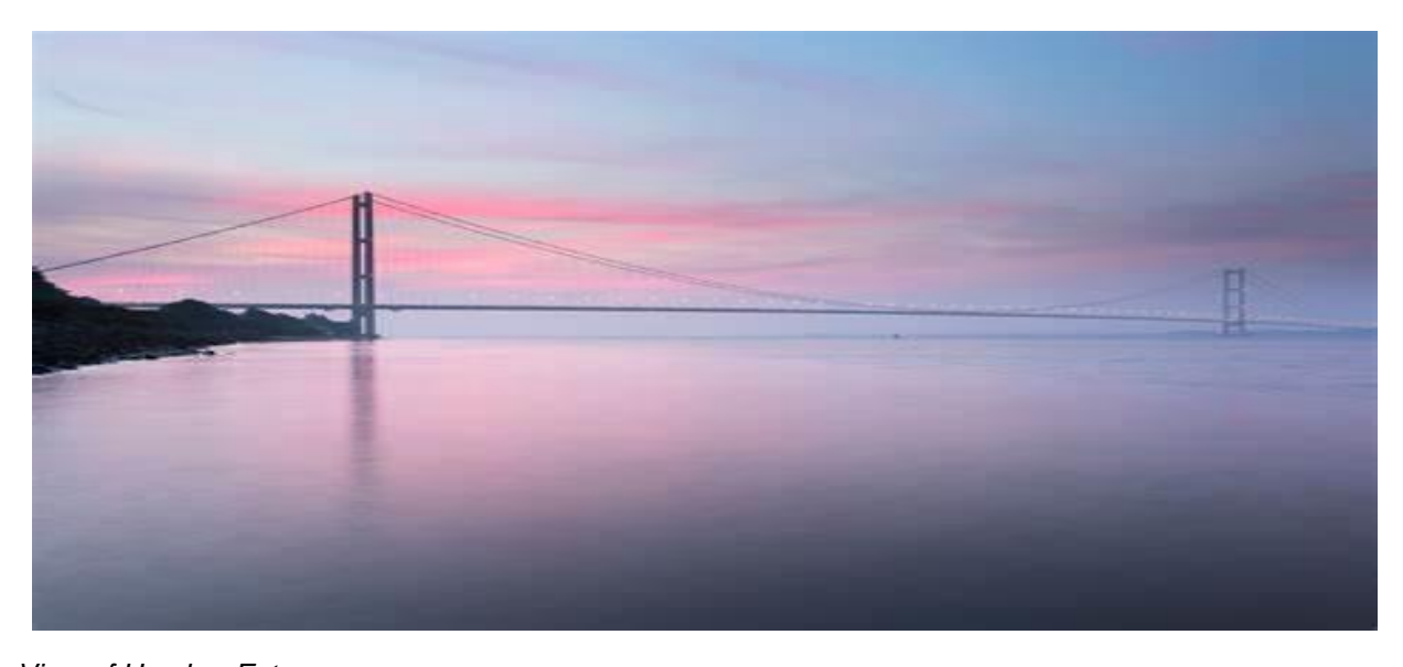
View of Humber Estuary.