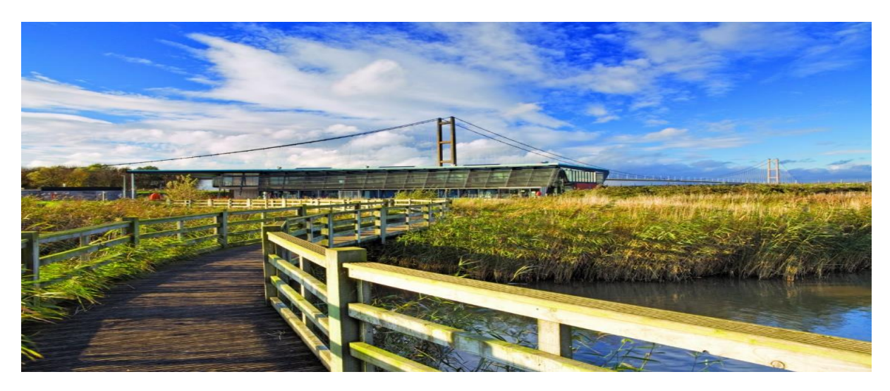
Waters' Edge Visitor Centre and Country Park, Barton.