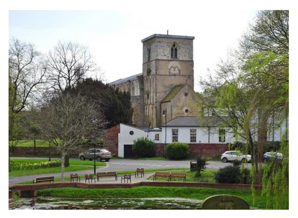
St Peter's Church, Barton.